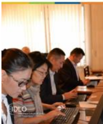
E-ENABLING SUSTAINABLE DEVELOPMENT. LESSONS FROM E-JUSTICE PROGRAMMING IN KYRGYZSTAN

E-enabling Sustainable Development reflects on the results of an IDLO project in Kyrgyzstan in cooperation with USAID to strengthen access to justice through e-justice.